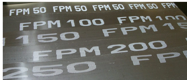
Typical CIJ marks— 32-dot font