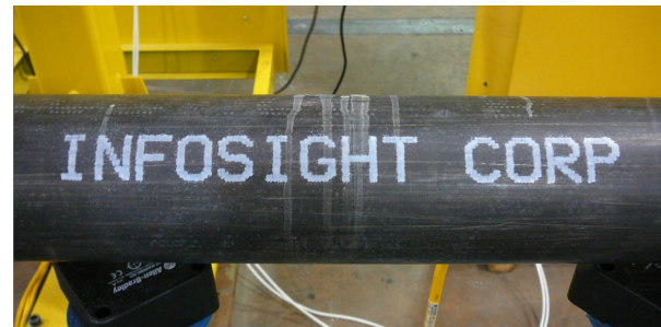
Typical DOD mark— 16-dot font