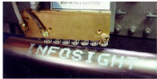
Typical I-DENT mark—5x7 font